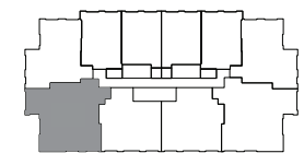
RESIDENCE 303, 403, 503