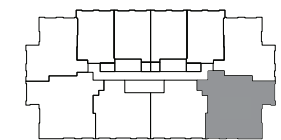
RESIDENCE 308, 408, 508